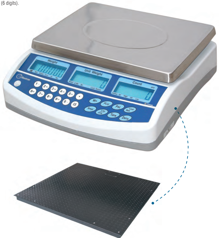
Connectable to auxiliary platform